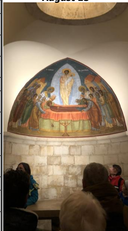
Church of Dormition, Jerusalem. Apostles at the Dormition of Mary.